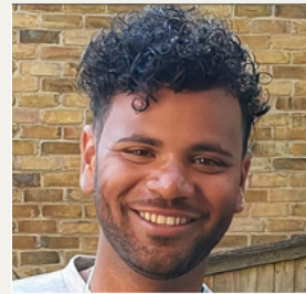
Amerat Raft Black Members (g)