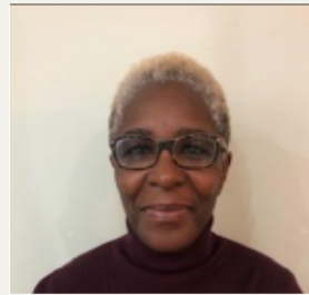
April Ashley Black Members (f)